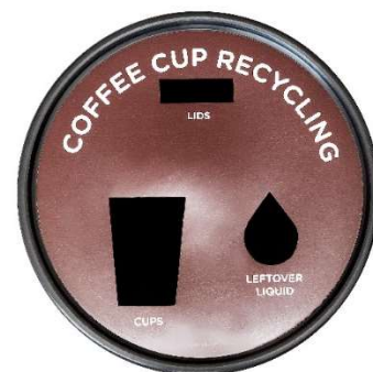
Coffee Ecocylinder (3 partitions) - R125 per unit pm