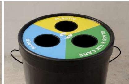
3-waste - R115 per unit pm