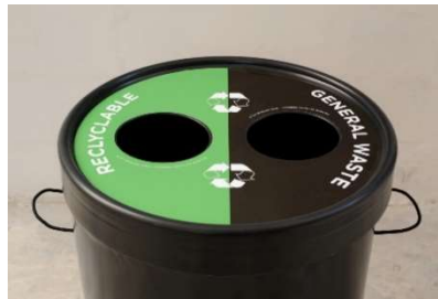
2-waste - R105 per unit pm