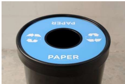
1-waste - R69 per unit pm

Prices quoted are per unit per month, over a 12-month period. Prices exclude VAT & first delivery – include lid branding. No deposits required. Terms and Conditions apply.