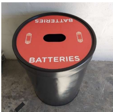
Battery Ecocylinder - R79 per unit pm