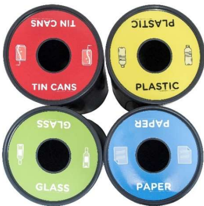
1-waste Ecocylinders - R69 per unit pm